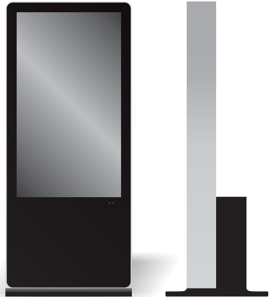
CUSTOM COLOURS AVAILABLE ON REQUEST